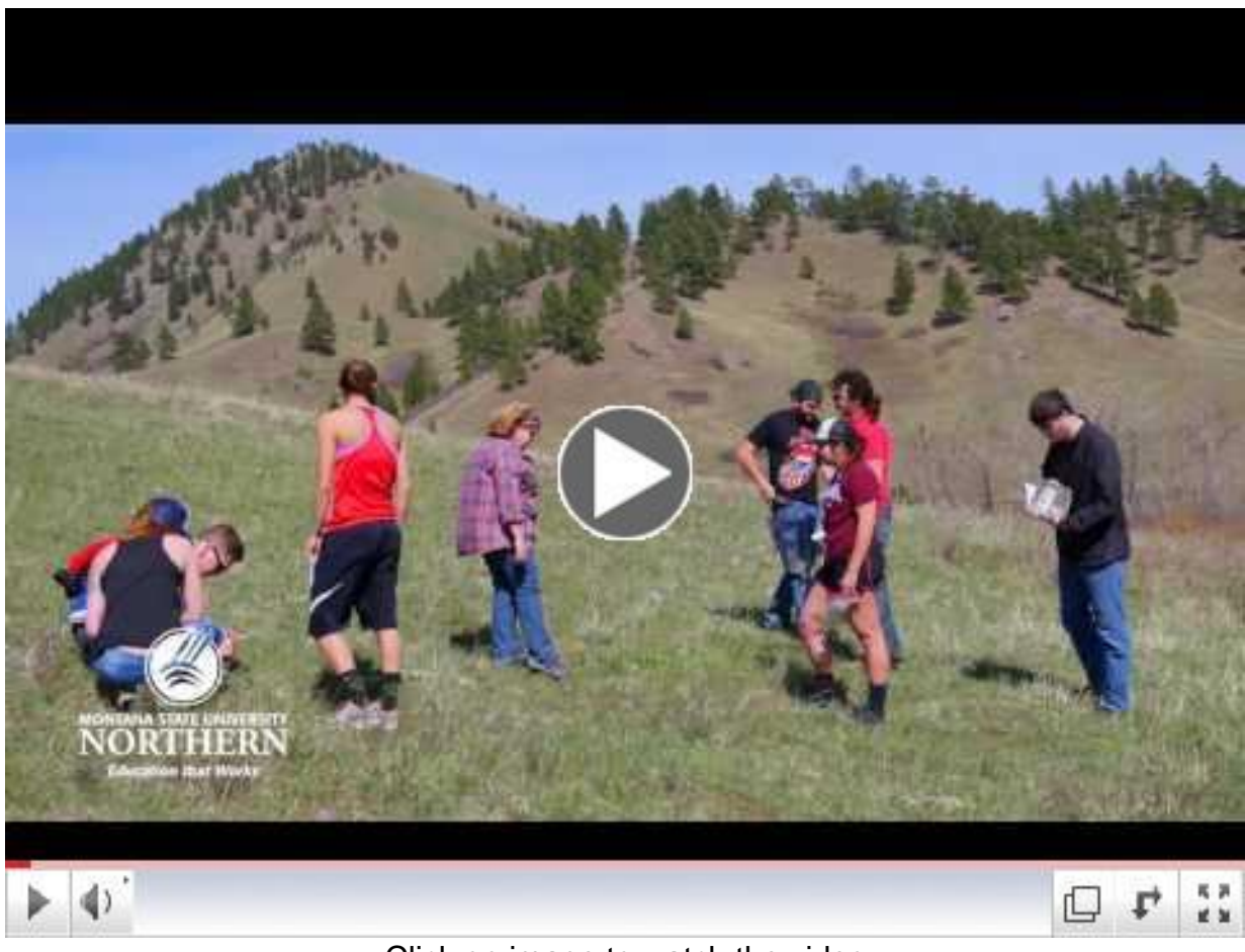
Click on image to watch the video