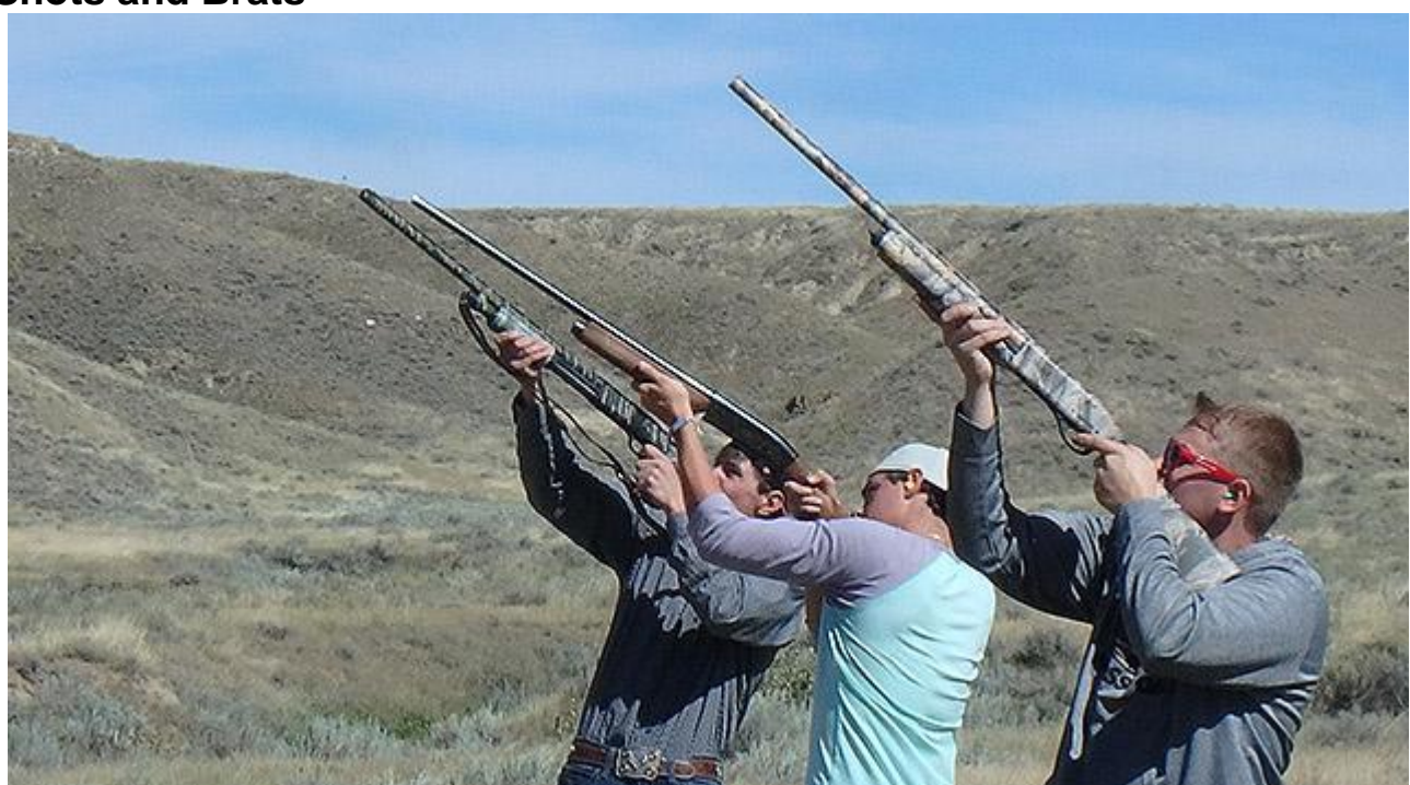
Chi Alpha hosted their biannual Shots n' Brats event last Saturday. It was a beautiful afternoon to shoot guns and eat bratwurst.