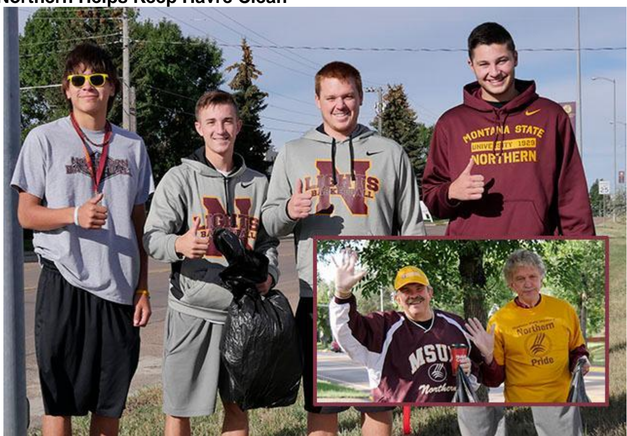
Last Saturday morning, several Northern students, staff and faculty got up early to help keep Havre looking its best by picking up the trash along 5th Ave and the 13th St. hill. The Chancellor's office brought the garbage bags, coffee, and Grateful Bread cinnamon rolls as a thank you for all of their hard work.