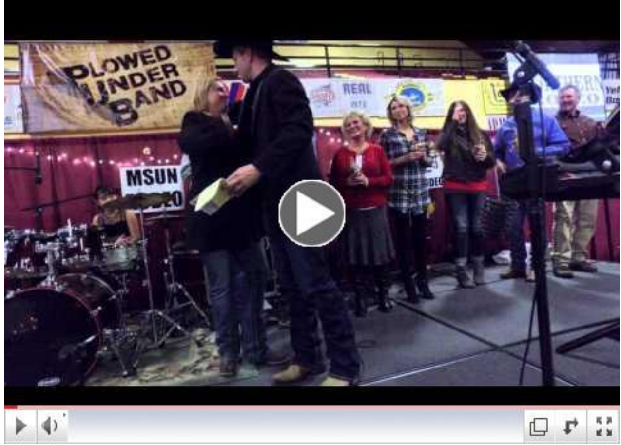
Click on picture to watch the Cowboy Christmas video

https://www.youtube.com/watch?v=QC-22QXyMMM