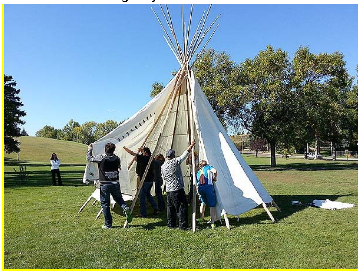
The 1997 Montana Legislature designated the fourth Friday in September of each year "American Indian Heritage Day." In honor of that event MSU-Northern has a special display in the library and the Sweetgrass Society raised Northern's tepee on the East lawn.