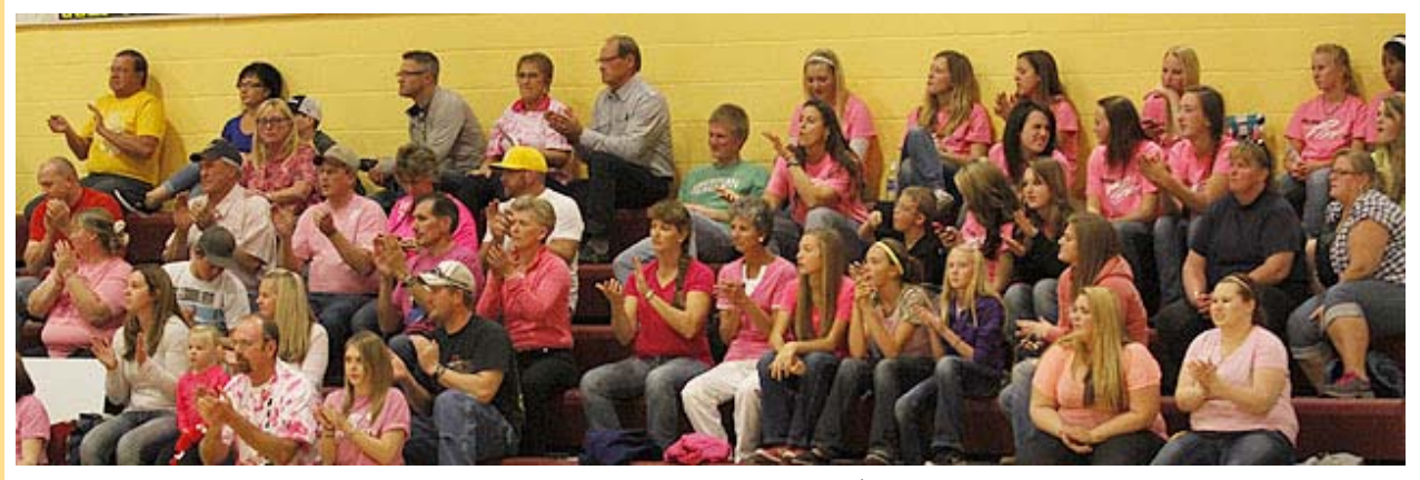
October is Breast Cancer Awareness Month. On October the 26<sup>th</sup>, MSUN family showed support for Breast Cancer Awareness by donning pink at the men's football and women's volleyball games.