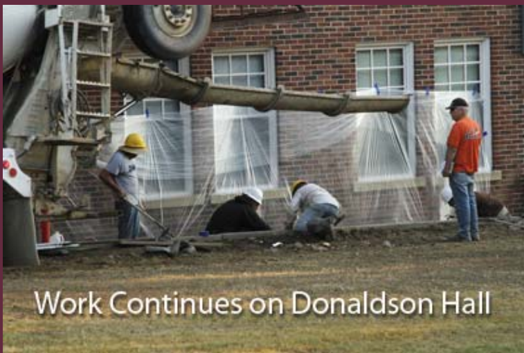
Work Continues on Donaldson Hall