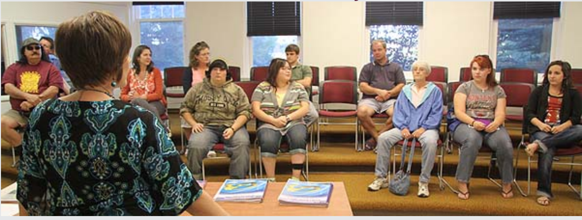
Twenty-four people signed up to be a part of the MSU-Northern Community Orchestra during