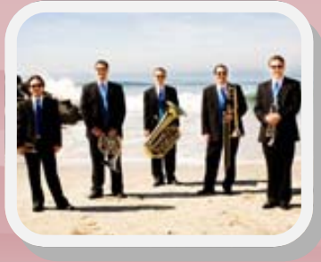
Presidio Brass February 16, 2012

Presidio Brass is a dynamic force in American brass chamber music. With a unique and exciting repertoire written specifically for the ensemble, Presidio Brass is committed to providing engaging musical programs as well as developing close ties to their audiences.