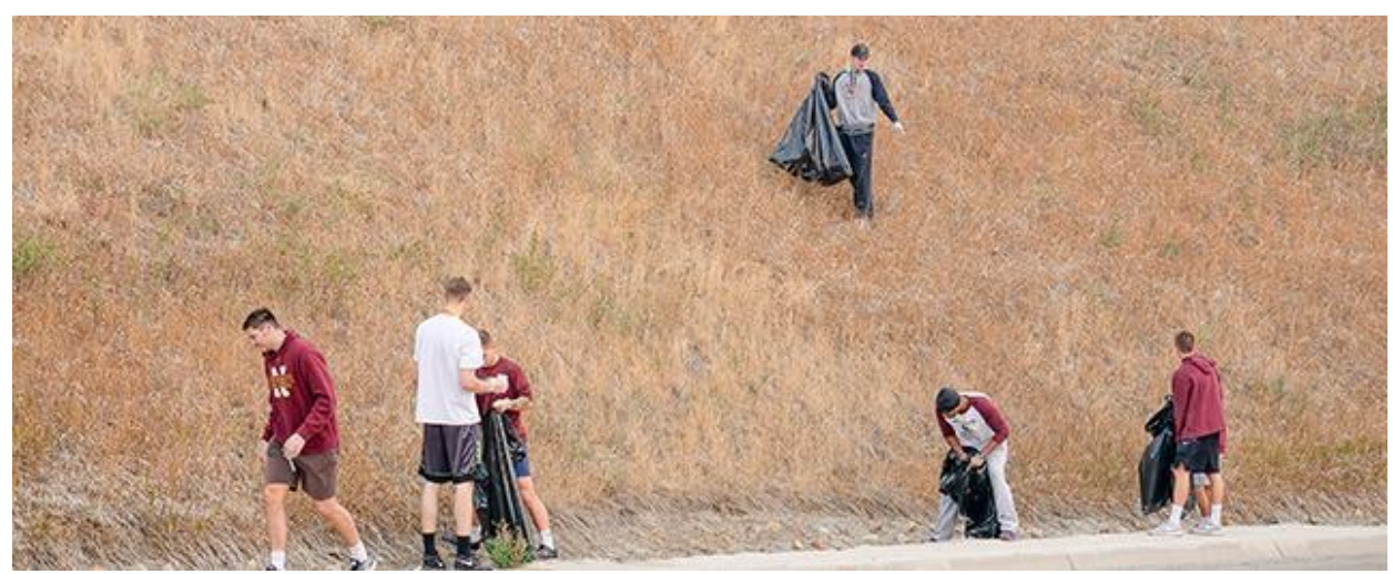
Twenty-four students, staff, and faculty came together last Saturday morning to help clean up the streets and sidewalks along 5<sup>th</sup> Avenue and up the 13<sup>th</sup> Street hill. The participants collected close to 22 bags of garbage and enjoyed some coffee and cinnamon rolls from Grateful Bread.