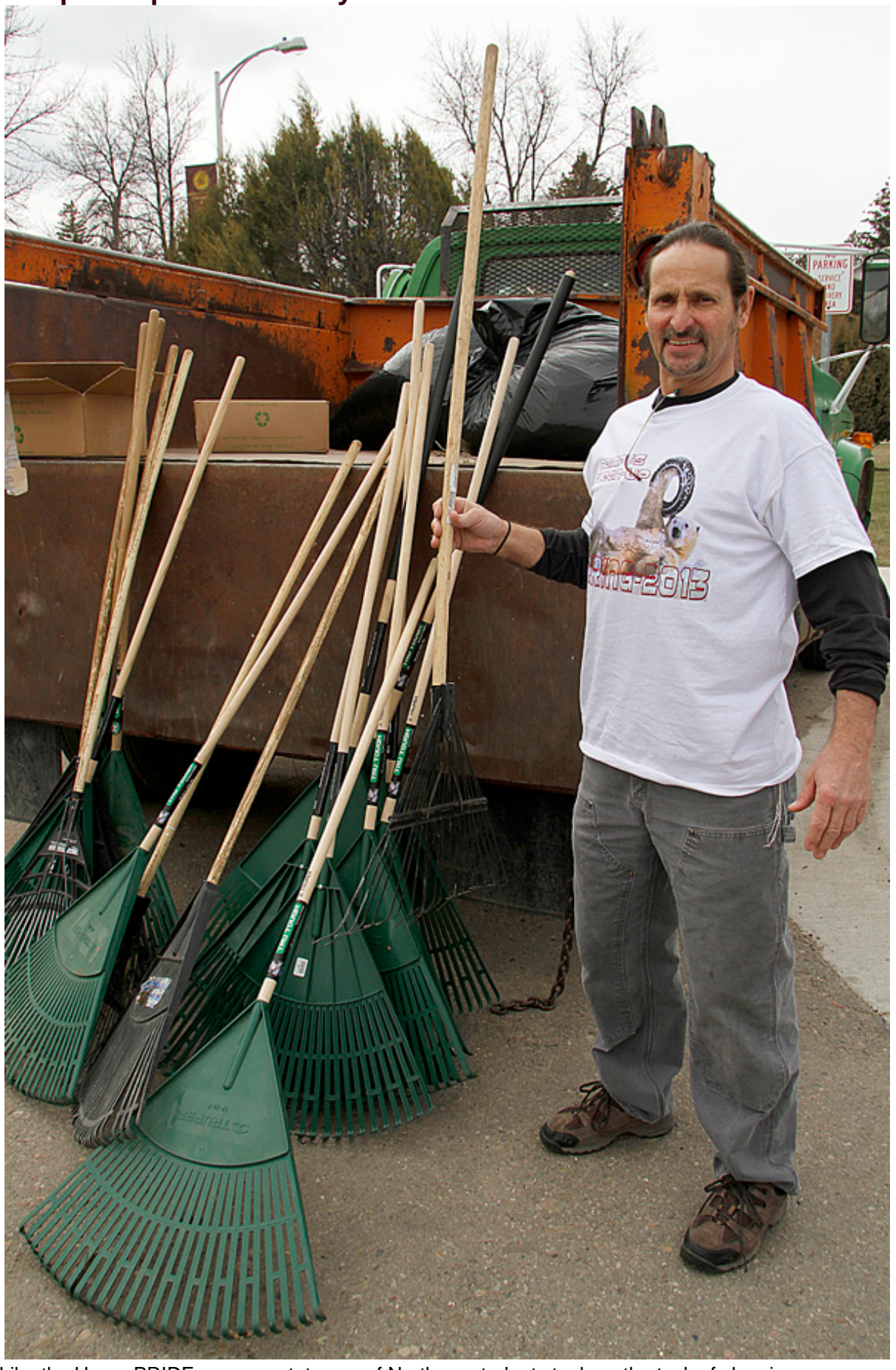
Like the Havre PRIDE movement, teams of Northern students took on the task of cleaning our campus