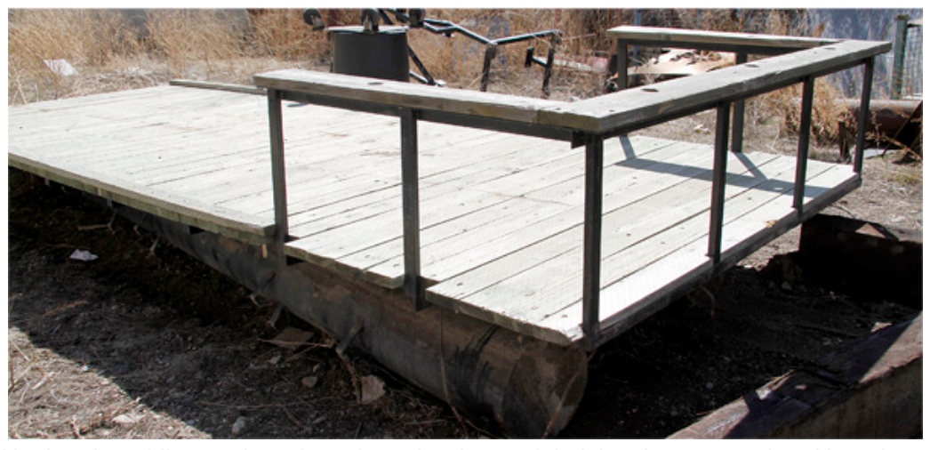
Northern's welding students have been hard at work helping the community with projects. Recently.