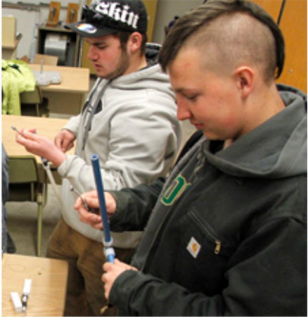
(left) Sanjel was just one of the many industry partners who provided specialty equipment for the event. (right) Students learn about plumbing fittings and equipment as they build their own marshmallow guns.

TekNoXpo was in full swing on this chilly April Wednesday! Each year, high school juniors and seniors from across the state visit our campus to learn about the programs MSU-Northern's College of Technical Sciences has to offer and to get hands-on experience with some cool equipment.