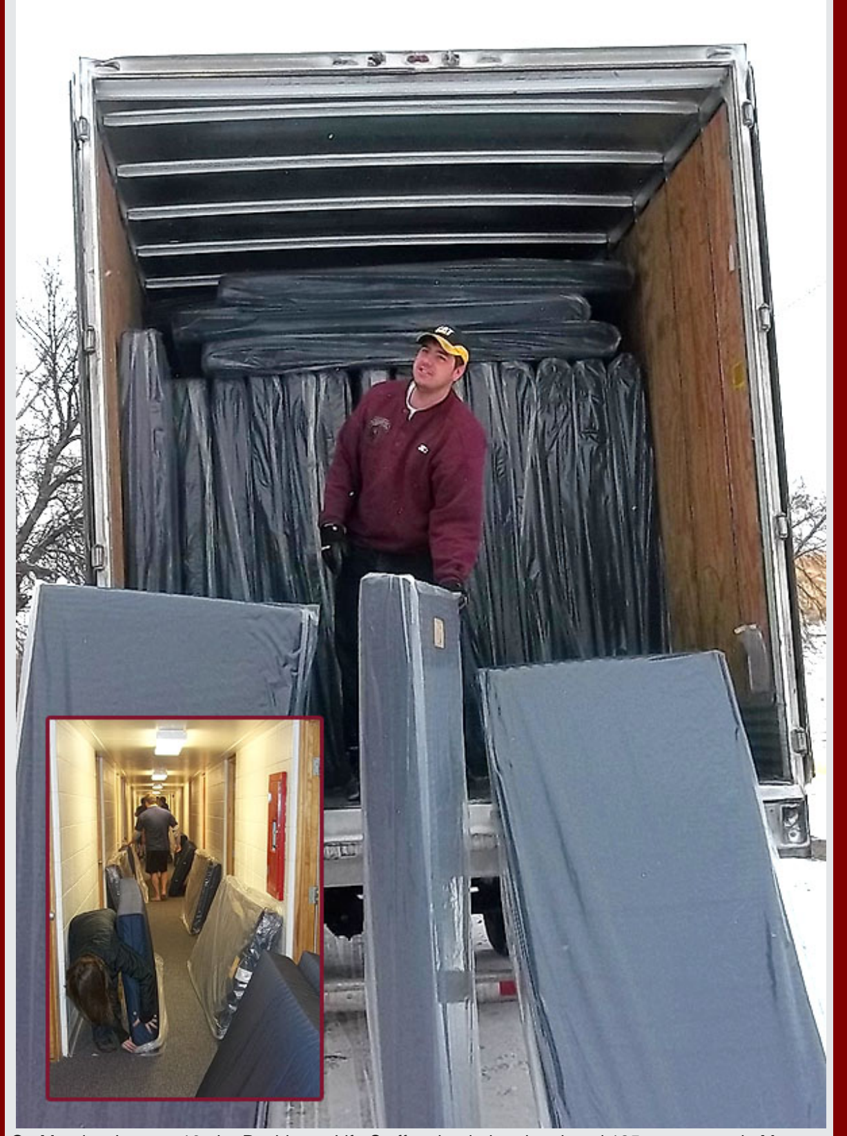
On Monday January 16, the Residence Life Staff, unloaded and replaced 125 mattresses in Morgan Hall with brand new ones. The staff completed this task in less than 90 minutes.