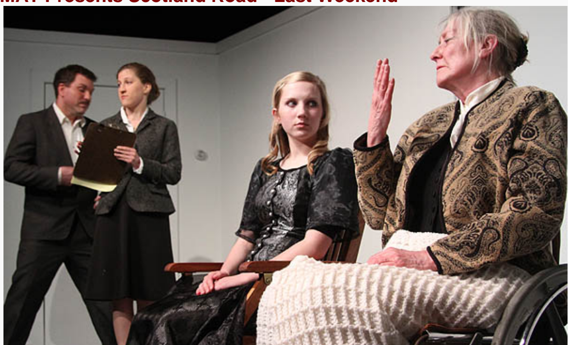
Tonight and tomorrow night are the last chances to enjoy the MAT play Scotland Road.

Scotland Road is a play about a woman in nineteenth century clothing who is found floating on an iceberg in the middle of the North Atlantic. When rescued, she says only one word: Titanic. The woman, Winifred, is taken to an isolated spot on the coast of Maine where an expert on the sinking of the liner, a mysterious man named John, has arranged to interrogate her for six days. His goal: to crack her story, get her to confess she's a fake and reveal her true identity; his one clue: her enigmatic references to an unknown place called "Scotland Road."