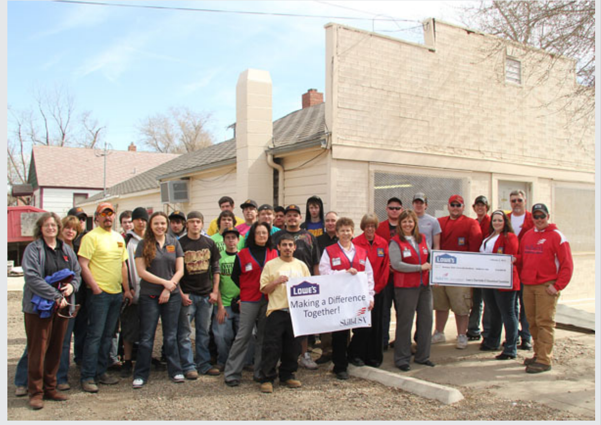
Lowe's Charitable and Educational Foundation has awarded a $10,000 grant to Montana State University-Northern for an addition to the Havre Food Bank.

The approximate 14'0 x 18'0 addition will provide numerous benefits. The addition will allow for easier unloading and provide a storage area for inventory before the products are displayed in the main food bank area. The addition will allow for donated food to be delivered to the Havre Food Bank in all weather conditions. Additionally, it will be used as a temporary storage area and storage space will no longer be a problem. MSU-Northern is partnering with the local SkillsUSA Chapter at Havre High School and YouthBuild of North Central Montana. Students will build the addition and complete this building project by June, 2012.